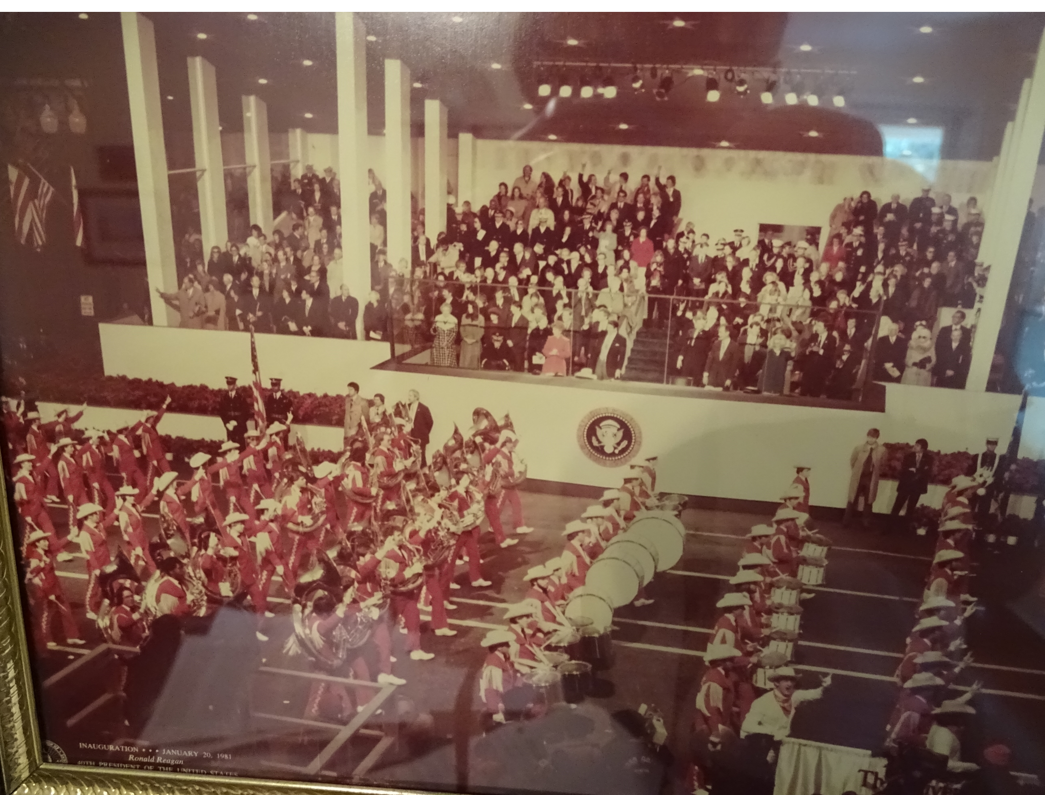
INAUGURATION • • • JANUARY 20, 1981 Ronald Reagan 36TH PRESIDENT OF THE UNITED STATES