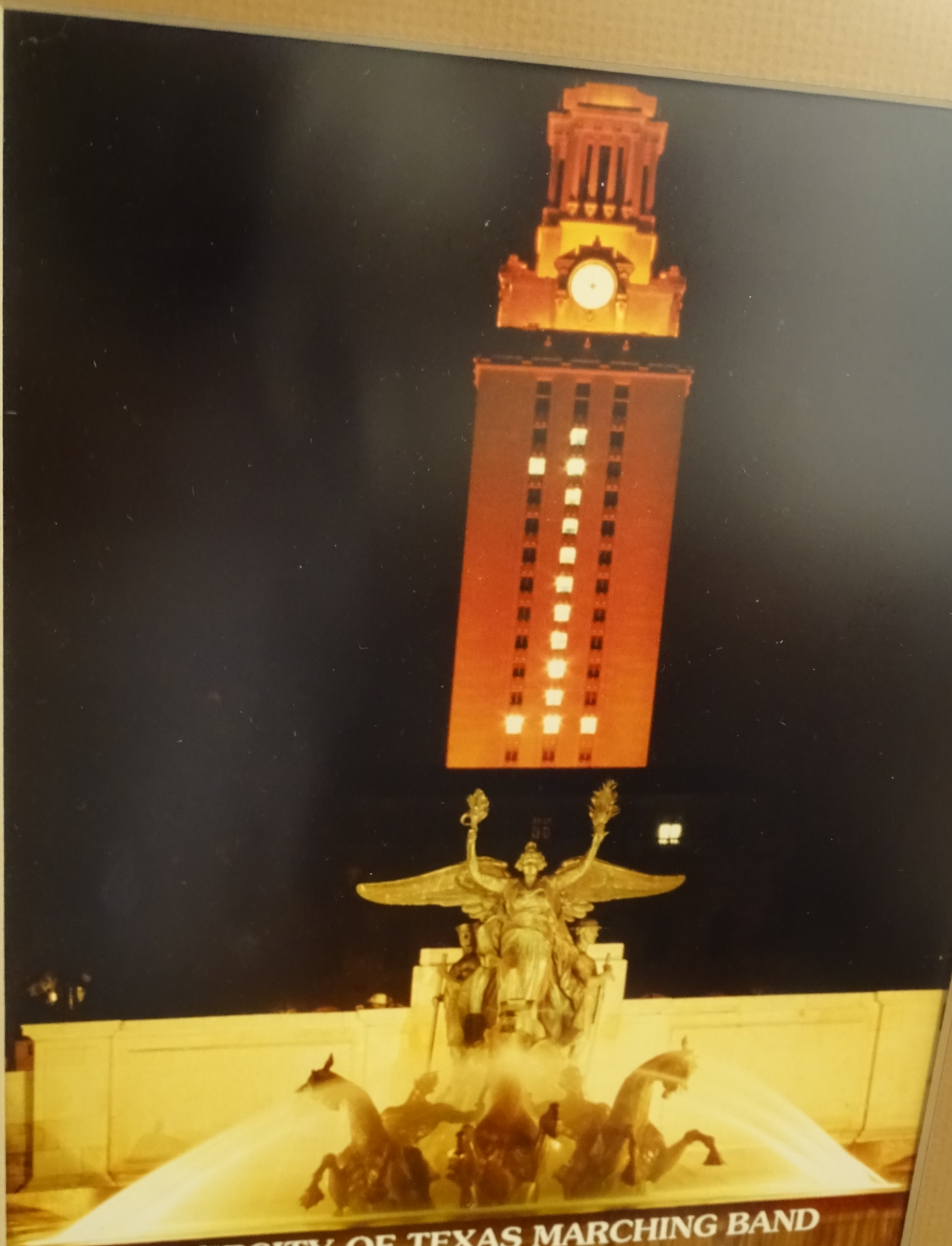
UNIVERSITY OF TEXAS MARCHING BAND 1986 Sudler Award Recipients