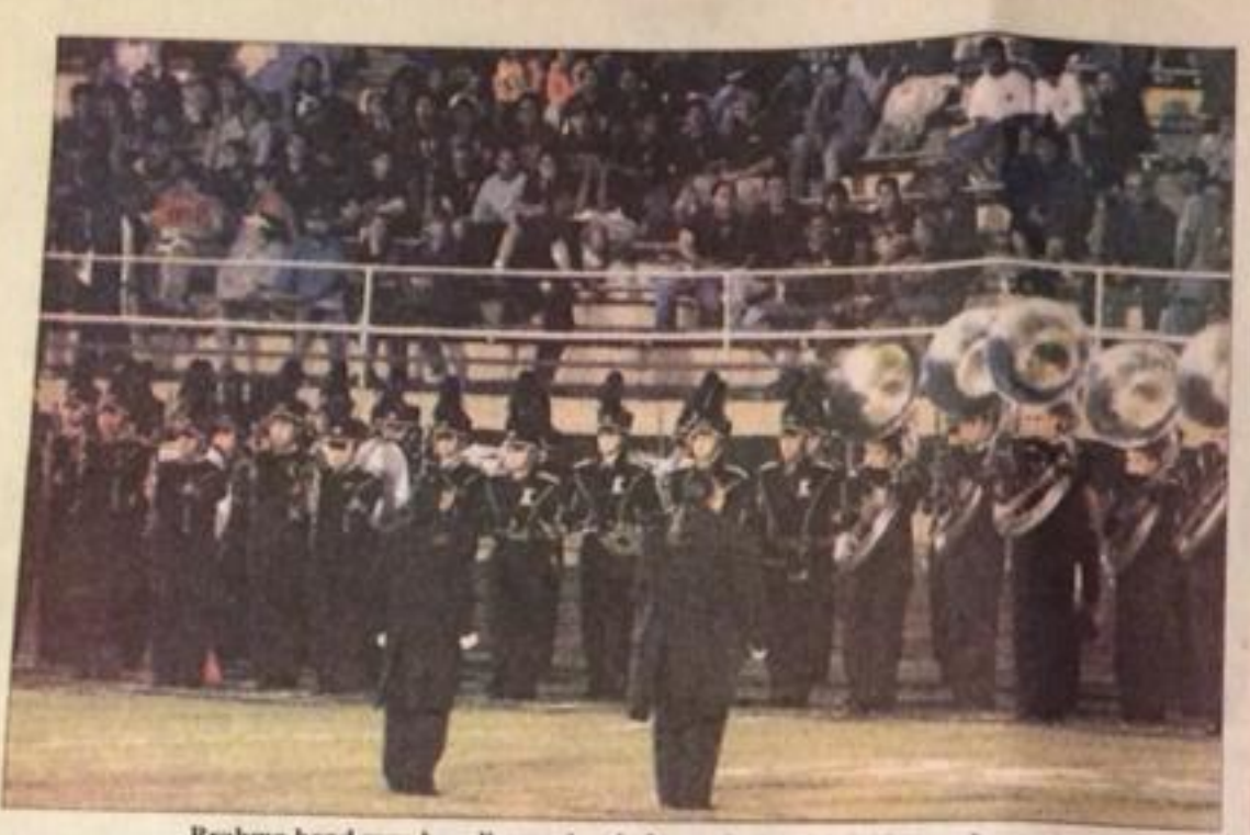
Brahma band members line up just before going on the field to perform.