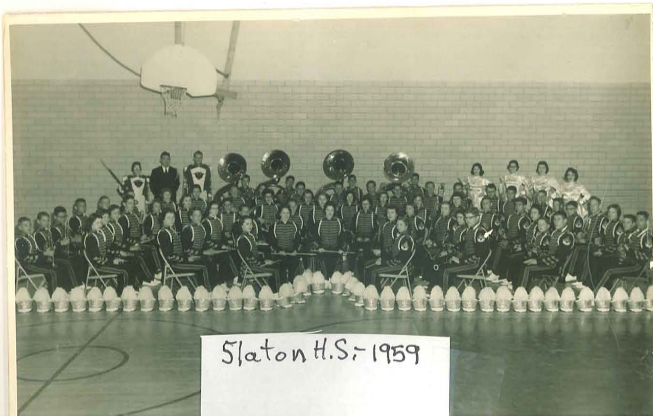
Slaton H.S. - 1959