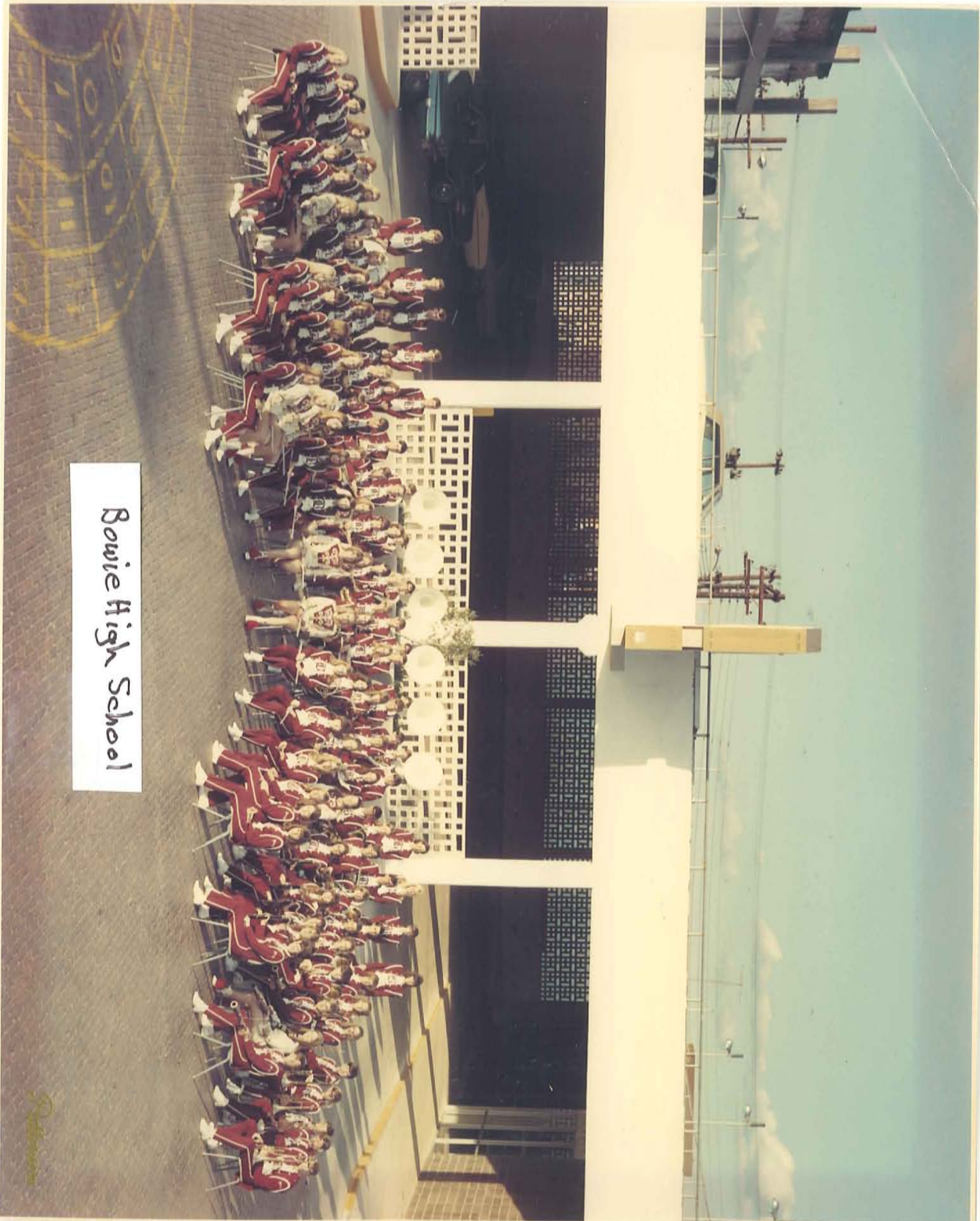
Bowie High School