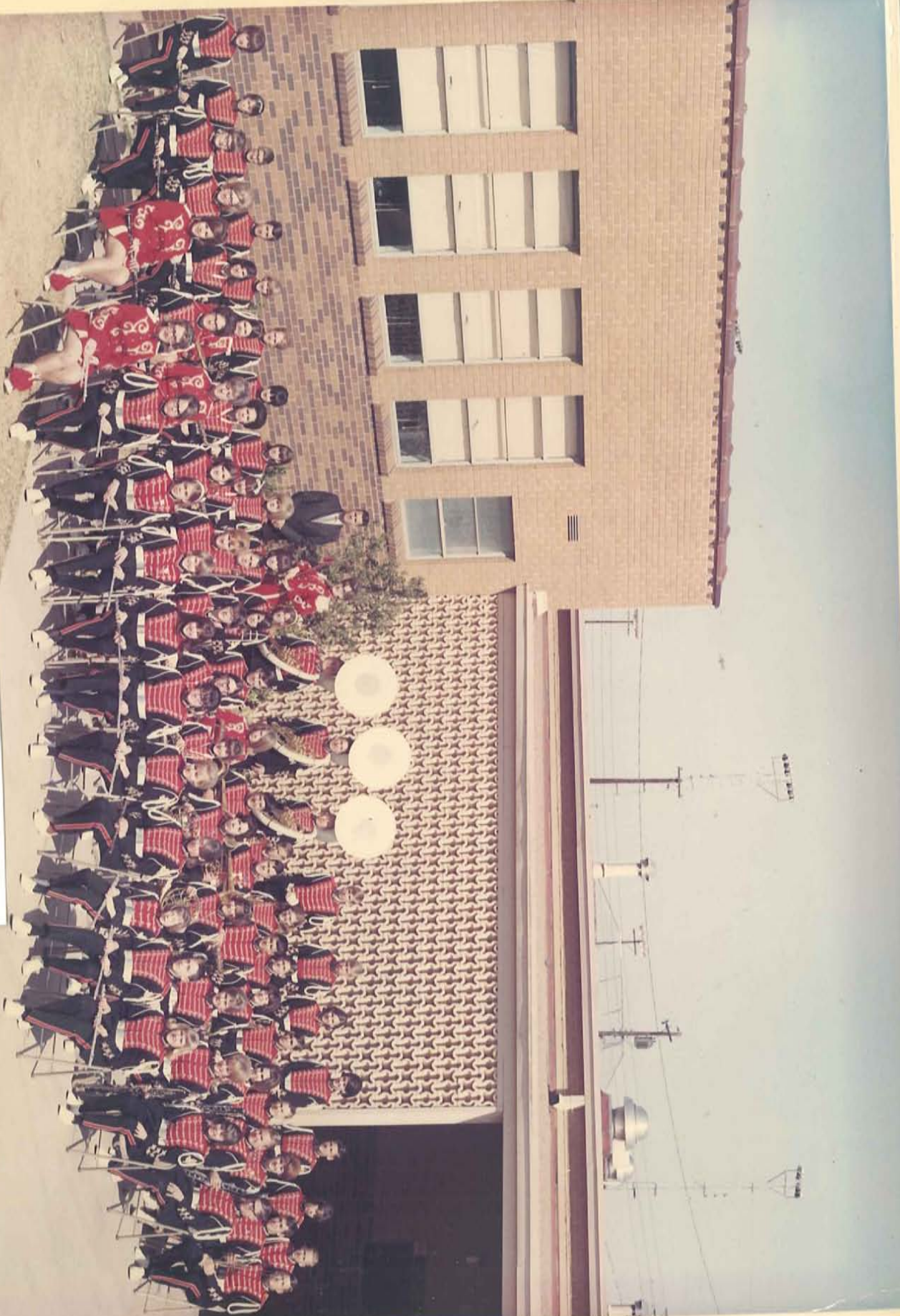
Holiday H.S. - 1966 1967