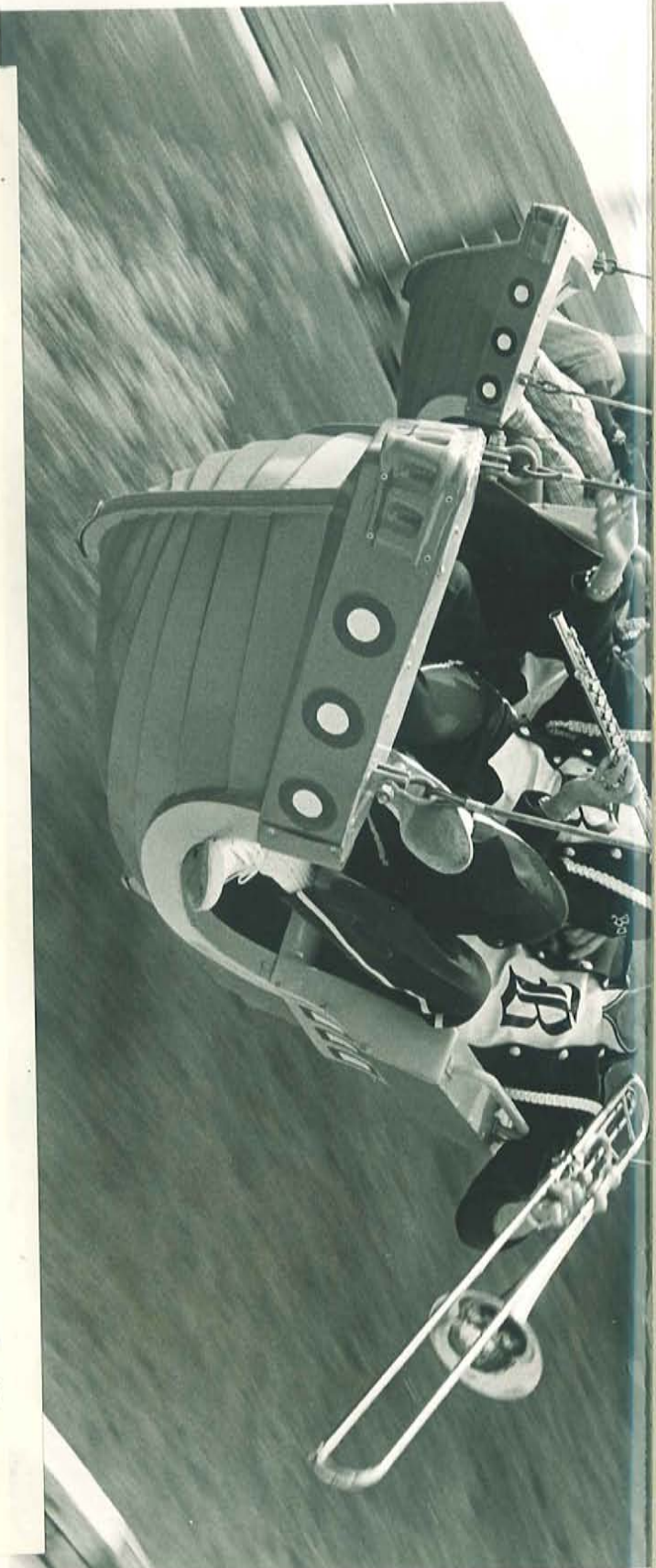
Three members of the Bowie High School band, Bowie, Texas, get in the swing of things following their performance in Worlds Of Fun's second annual Festival of Bands recently. The band members joined in the competition against 27 of the Midwest's top award-winning bands for the two-day festival at Kansas City's internationally-themed family recreation complex.