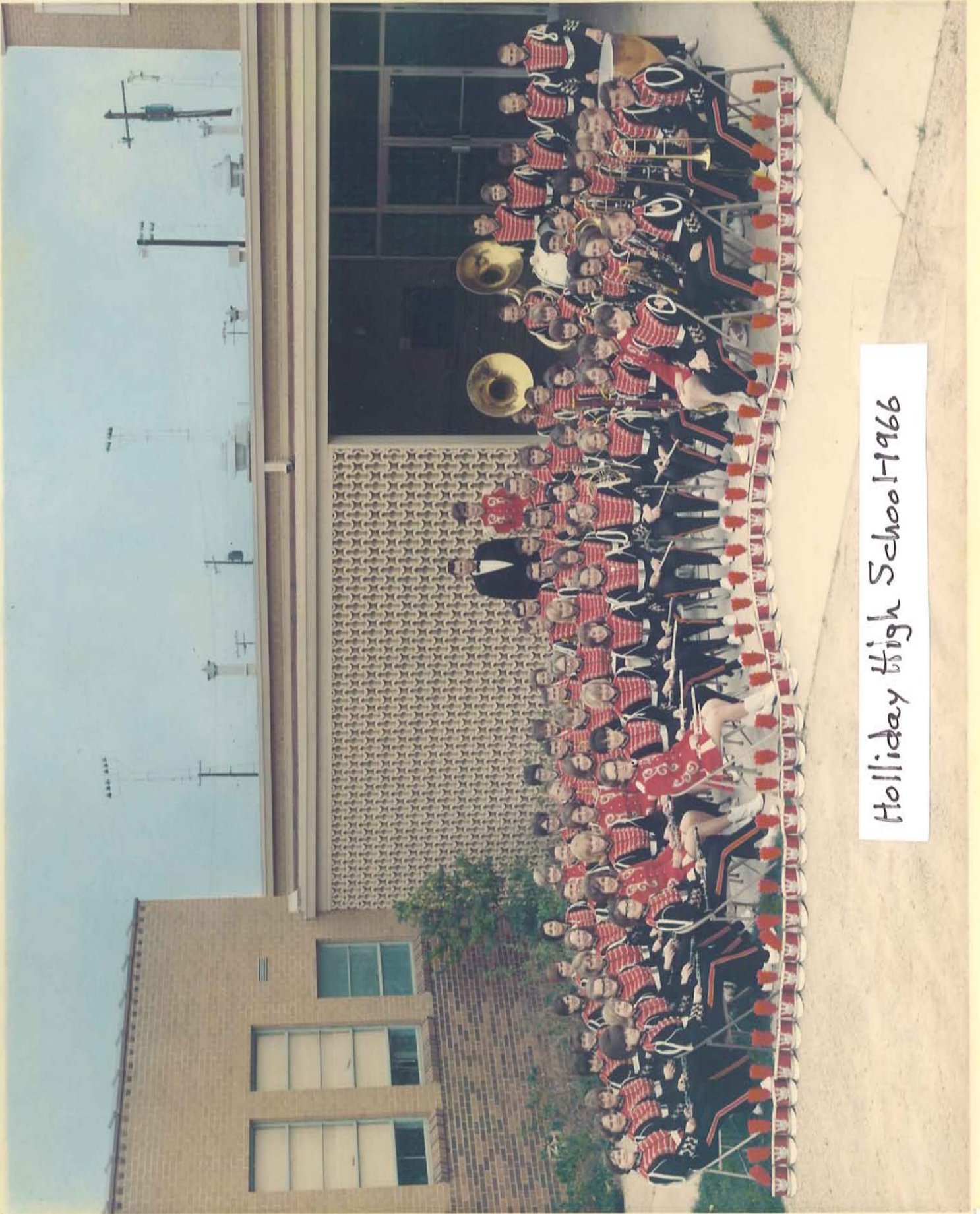
Holliday High School 1966