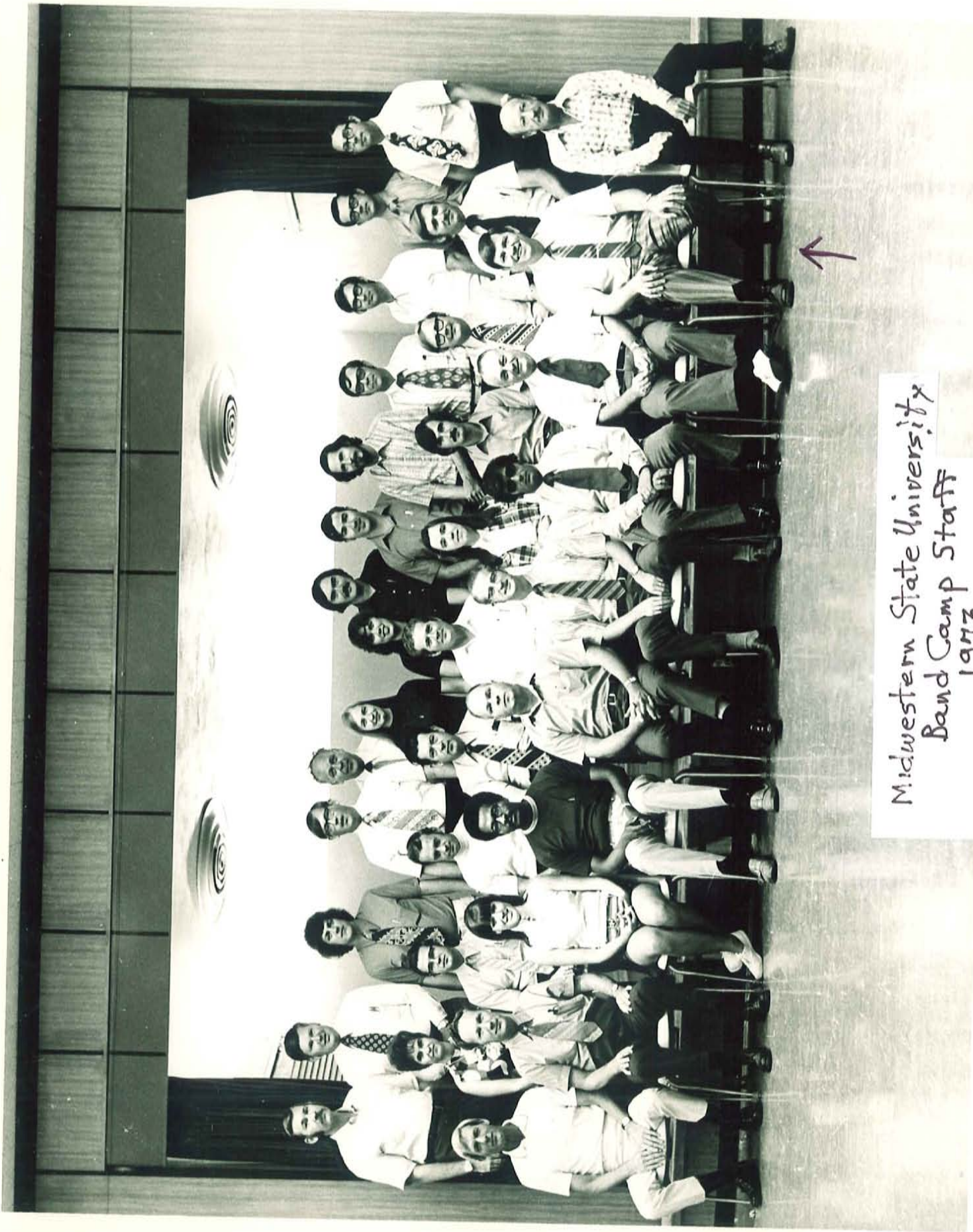
Midwestern State University Band Camp Staff 1973