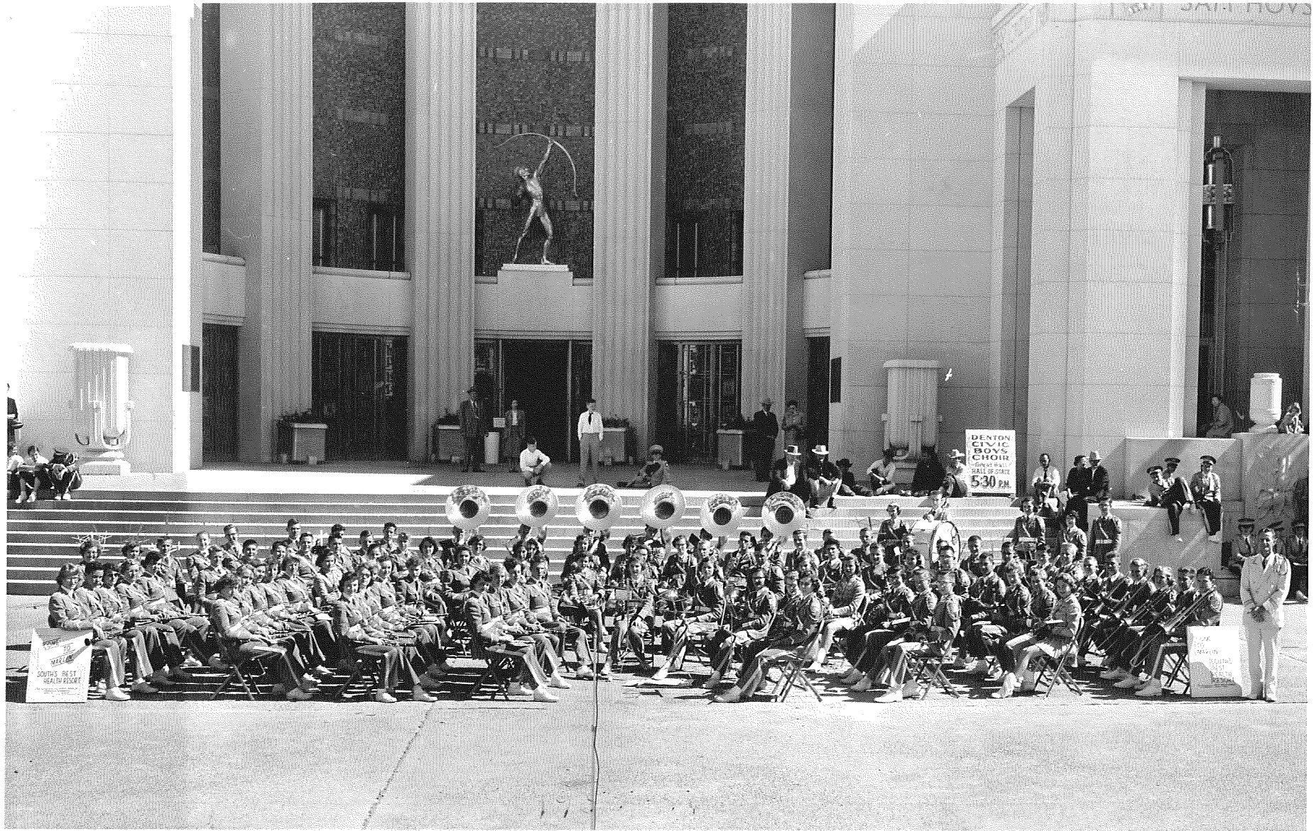
Concert in front of Hall of State, Dallas Fair Grounds